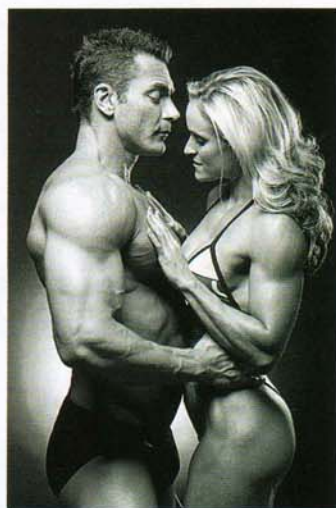
This mother of two, who is married to a bodybuilder, has made the sport central to her life.

about 15 years ago, I was quite an aerobics junkie. It wasn't until early 2003 that I began training with weights. The changes weight training made to my physique were amazing and now I am hooked. A combination of heavy weights and cardio as well as a good diet is the way to go in order to achieve the best results possible."