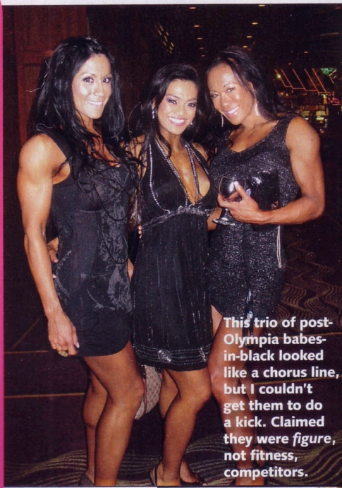
This trio of post-Olympia babes-in-black looked like a chorus line, but I couldn't get them to do a kick. Claimed they were figure, not fitness, competitors.